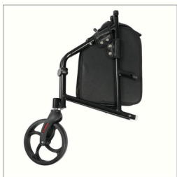
Mainframe and front wheel

The rollator is delivered partially disassembled in the box. Assembly is quick and straightforward, typically requiring 5 minutes to complete.