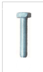
Long screw x2