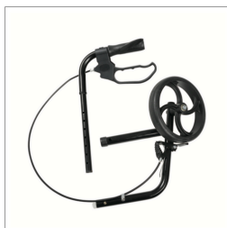
Handrail and rear wheel x2