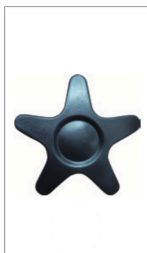
Star knob x2

Step One (Rearwheels installation): Unfold the main frame and insert the rear wheel attachment tube into the main frame until the locking balls click securely into place. Ensure the locking balls align and snap into the designated slots. (Refer to the figures below).